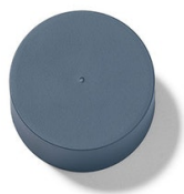
STRING LIGHT EU/UL ROSONE BLU F6482014