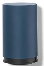
STRING LIGHT EU FLOOR SWT BLU F6484014