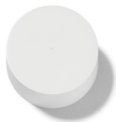
STRING LIGHT EU/UL ROSONE BCO F6482009