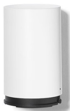
STRING LIGHT EU FLOOR SWT BCO F6484009